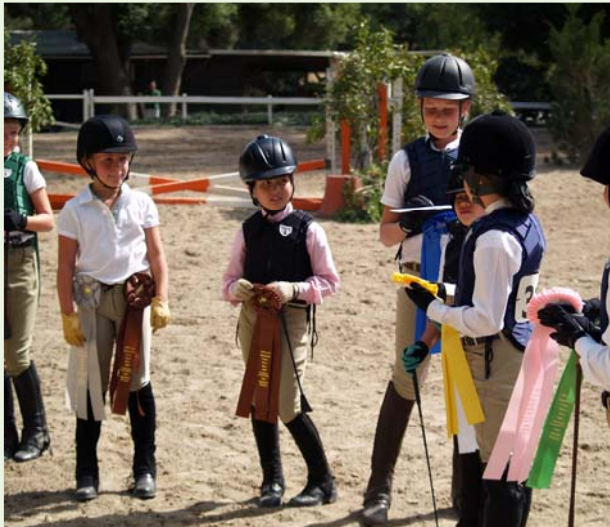
Second Levelers compare ribbons.