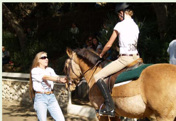
Are these stirrups even?

Many, many more photos are available on the Mill Creek Website!