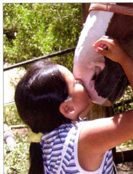
Horses In The Hood - Pg. 100