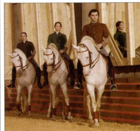
L'Académie du Spectacle - Pg. 104